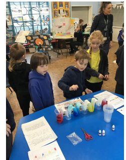
Photo galleries of both Science Week and World Book Day can be found on our website: